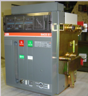
Replacement for FP-25