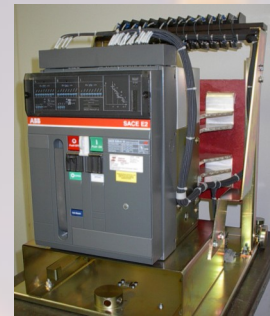
Replacement for DMB-50